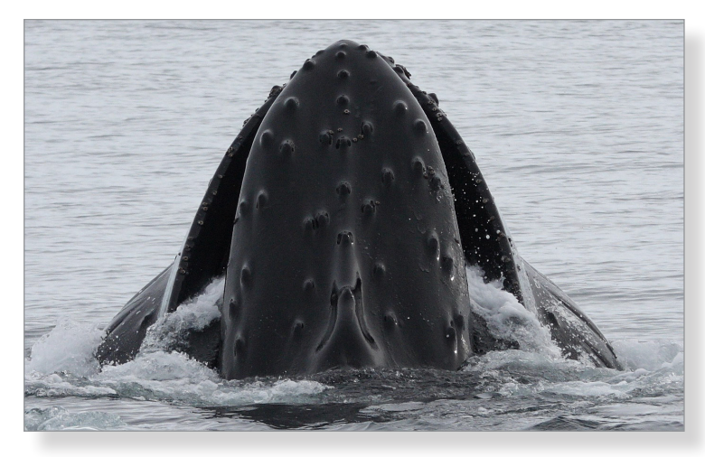
Humpback whale.

NOAA Fisheries is engaged in a number of activities to minimize whale entanglements. We are: